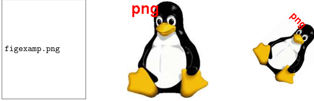
Figure 1 – same figure with draft option (left), normal (center) and rotated (right)