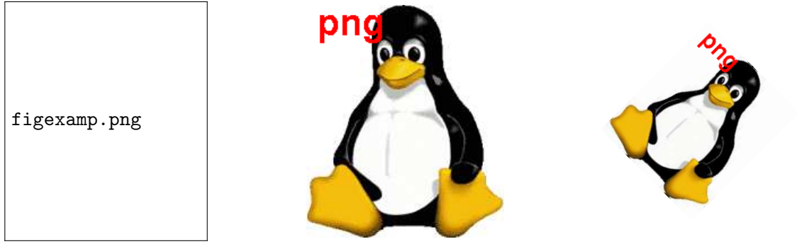
Figure 1 – same figure with draft option (left), normal (center) and rotated (right)

where k = j or j + 1 and \beta = \alpha or \alpha + 1 , but if k = j + 1 , then \beta \neq \alpha + 1 and similarly, if \beta = \alpha + 1 then k \neq j + 1 . c There are only 162 quark mixing matrices using these parameters which are to first order in the phase variable e^{i\delta} as is the case for the Jarlskog parametrizations, and for which J is not identically zero. It should be noted that these are physically identical and form just one true parametrization.